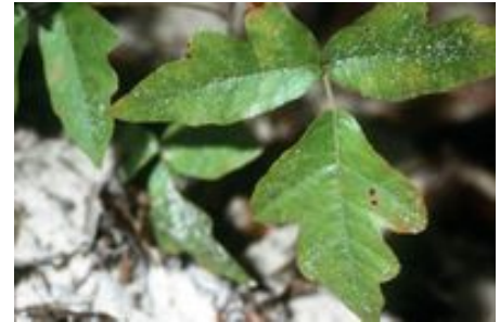
An example of Poison Oak.

Rashes from poison ivy, oak, or sumac are all caused by urushiol, a substance in the sap of the plants. Poison plant rashes can't be spread from person to person, but it's possible to pick up a rash from urushiol that sticks to clothing, tools, balls, and pets.