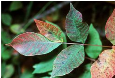
An example of Poison Sumac.

According to the American Academy of Dermatology, while "leaves of three, beware of me," is the old saying, "leaflets of three, beware of me" is even better because each leaf has three smaller leaflets.