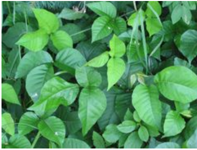
An example of Poison ivy.